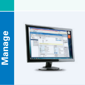
Intelligent Power Manager (IPM) Manage power devices in physical and virtual environments to maintain business continuity using automated, policy-based remediation