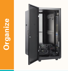
Racks and enclosures Secure and preserve the integrity of IT equipment.